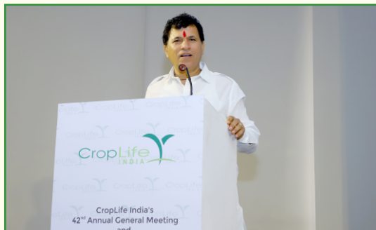
Shri. Kailash Choudhary Hon'ble Minister of State for Agriculture and Farmers Welfare Government of India