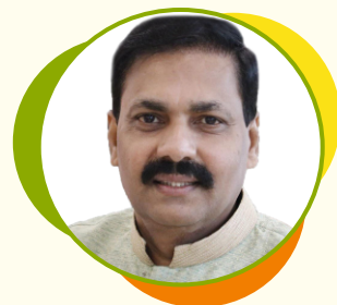
Shri Kakani Govardhan Reddy Hon'ble Minister of Agriculture Government of Andhra Pradesh