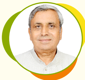
Shri Jai Parkash Dalal Hon'ble Minister of Agriculture Government of Haryana