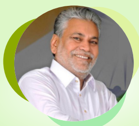
Shri Parshottambhai Rupala Hon'ble Minister of State, Ministry of Agriculture and Farmers Welfare, Government of India