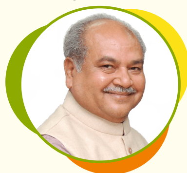
Shri Narendra Singh Tomar Hon'ble Minister of Agriculture and Farmers Welfare Government of India