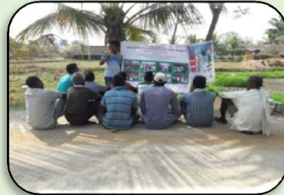
Classroom Training Sessions