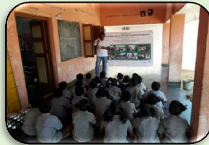
School Awareness Programmes