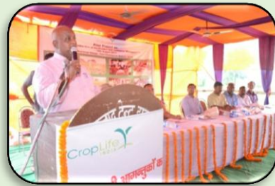
Shri Pramod Kumar, Hon'ble Minister of Transport, Govt. of Bihar addressing the gathering