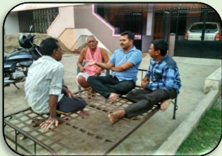
Door to Door Visits