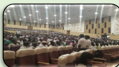
The Govt. dignitaries & more than 1200 people were present at the event