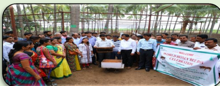
Visit to the Apiculture Unit