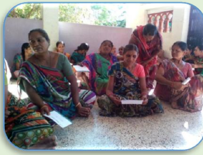
Women Self-help groups