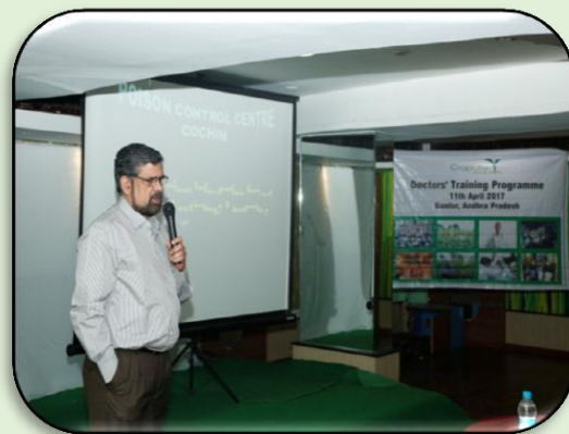
Doctors' Training Program