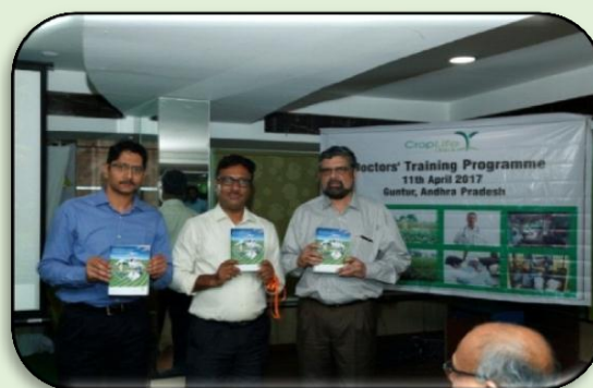
Release of Health Practitioners' Handbook