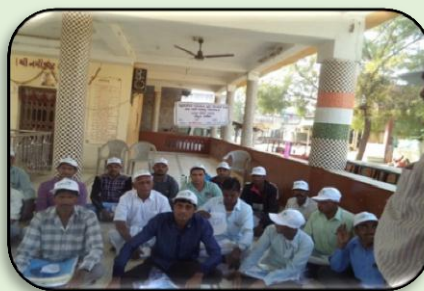
PPE Kit distribution & Farmer Training session