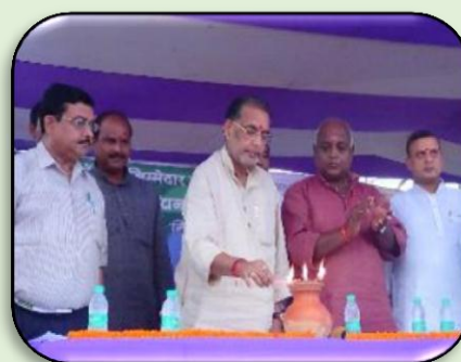
Hon’ble Union Minister of Agriculture, Shri Radha Mohan Singh at the Inauguration Event in 2015