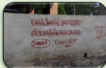
Storage Box & Wall slogans