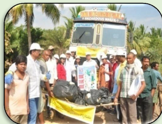
Container Collection and Safe Disposal Drive