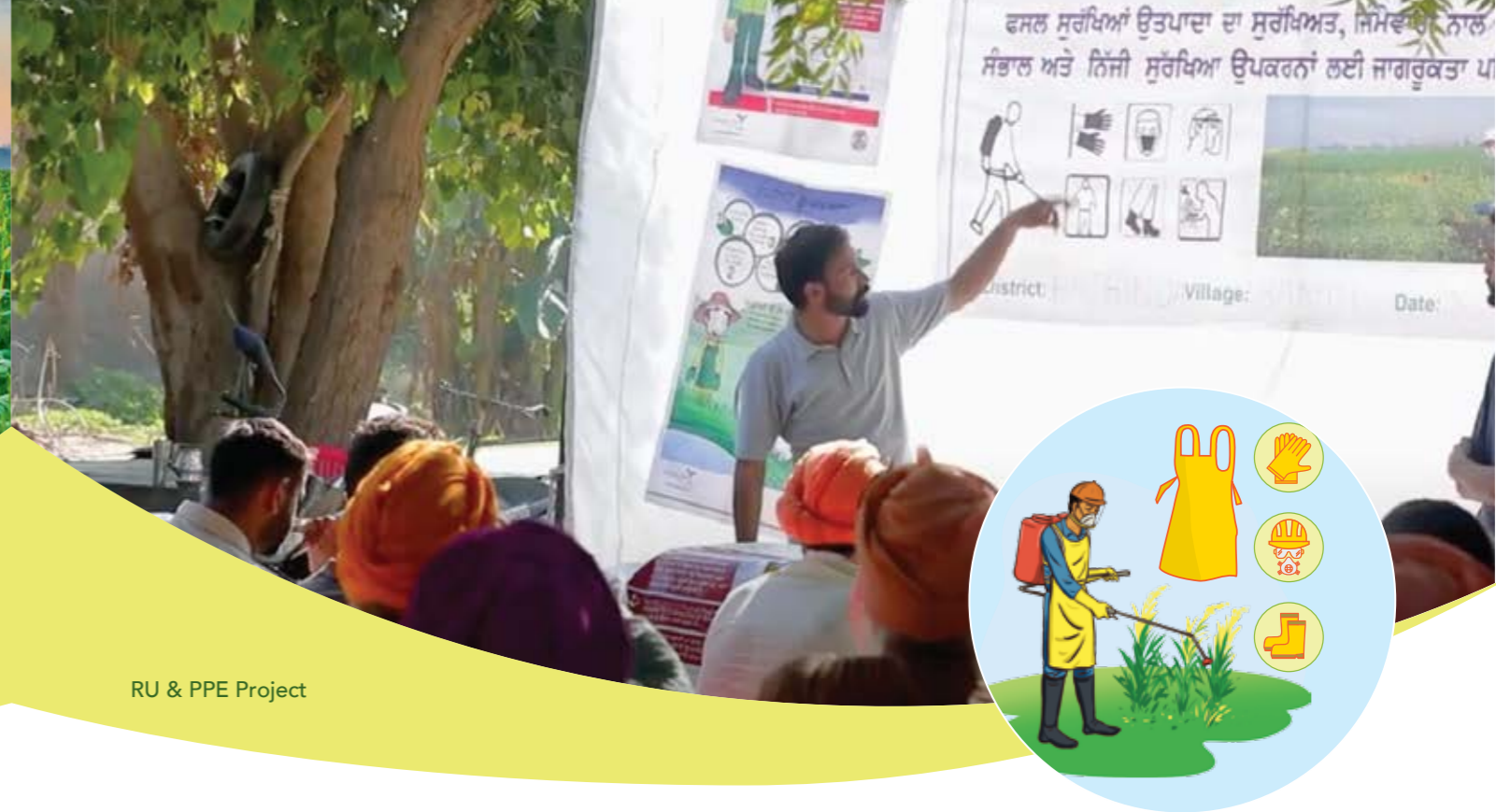
RU & PPE Project