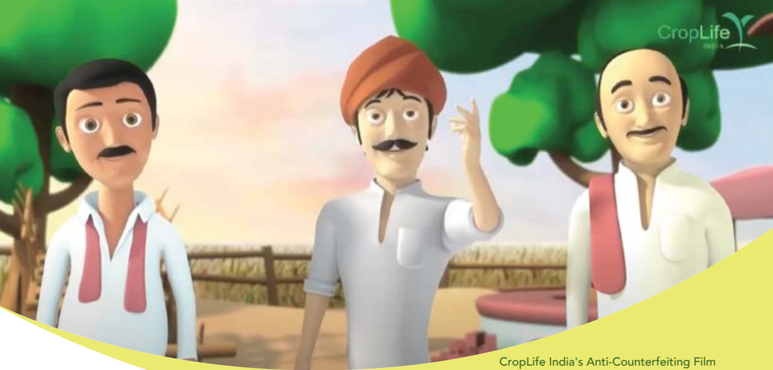
CropLife India's Anti-Counterfeiting Film