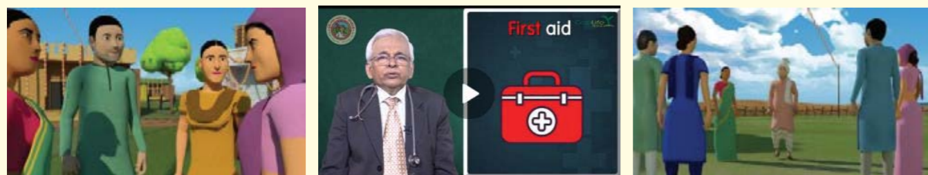
Doctors' & Farmers' Training Video