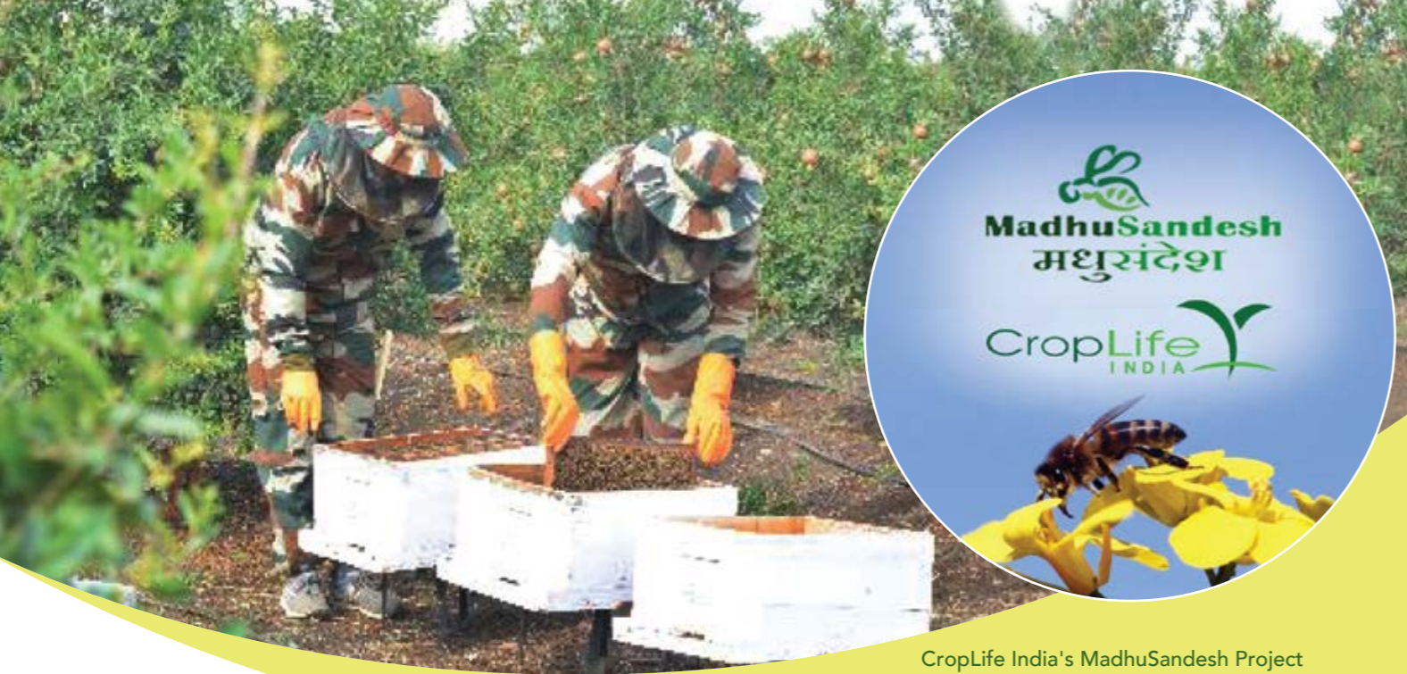
CropLife India's MadhuSandesh Project